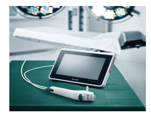
FIGURE 2: The aScope-2 with a transportable monitor.